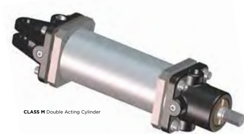
CLASS M Double Acting Cylinder

NOPAK Class M cylinders are strong and rugged in construction, especially designed for heavy duty applications in mines, quarries, steel mills, and in the heavy construction industries. Maximum system pressure is 650 PSI in all diameters to 4" – and 450 PSI in diameters of 5" and larger. The Class M construction is available in a full range of sizes and models (mountings) up through 14" in diameter for air, water or oil hydraulic service.